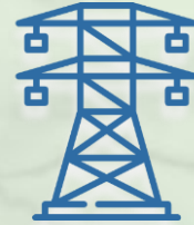
Electrical overhead cables