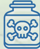
Use of poison