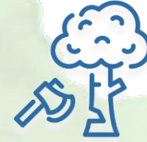
Destruction of natural habitat